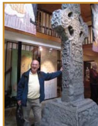
Des Hunter Cookstown Church Forum at the Colmcille Heritage Centre in September