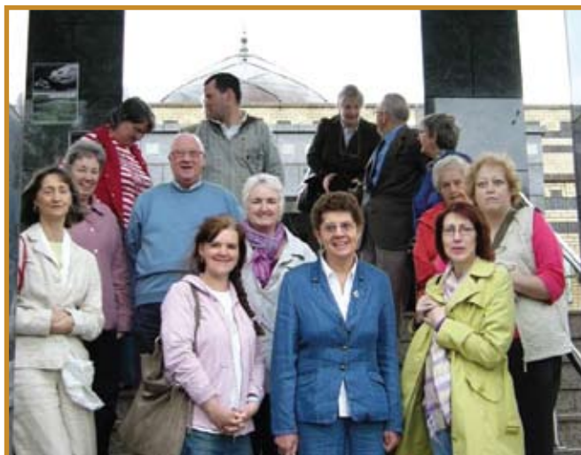
Members of FCF outside the mosque in Clonskeagh

Some members of the group also visited Christchurch Cathedral