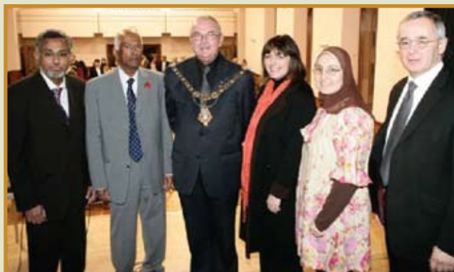
The Mayor of Coleraine with guest speakers at the Islamic Community Meeting