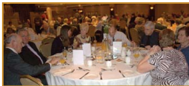
Some of the 130 guests from different churches who attended the celebratory anniversary event hosted at the Lodge Hotel in Coleraine