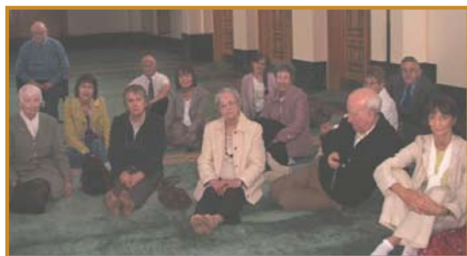
FCF members inside the mosque at Clonskeagh Dublin