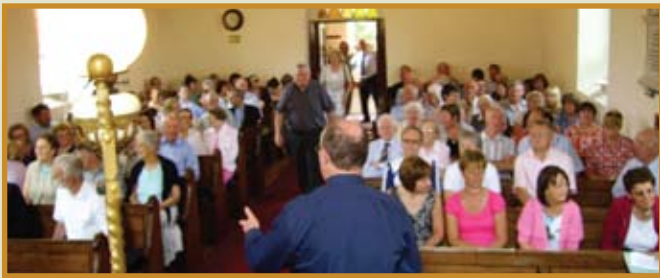
Packing ourselves into the Presbyterian Church

Our walk round the Tempo churches on Sunday, 28th June, was a great success, whether measured in numbers – approaching 100 – the expressions of appreciation of many participants, or the lovely weather the Lord blessed us with.